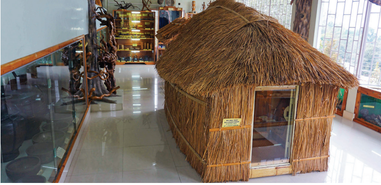
The museum's heritage section.