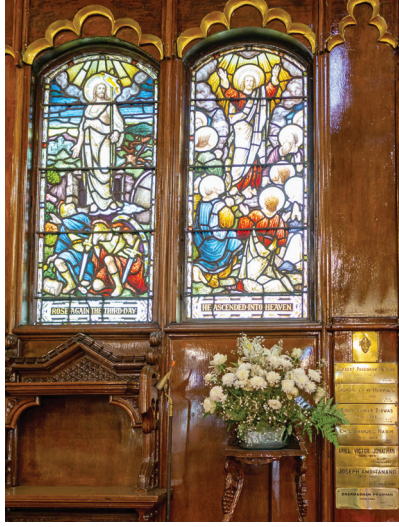
The church built in Tudor style, comprises wood from Myanmar, and tinted glasses from England.