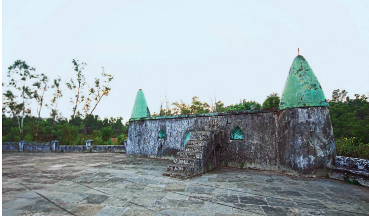
A wall with two minarets containing the mihrab located to the west of the main structure.