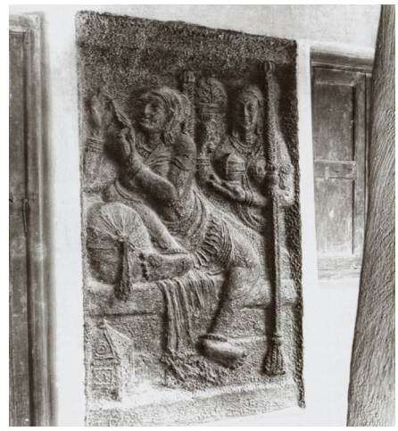
Relief work on Kalobari (Black house), Santiniketan

'This isn't painting, which needs just paper, pen, brush and colour. Sculpting is difficult business. One needs a variety of materials; one needs people. It all takes a lot of money.